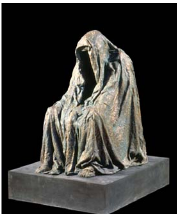
Sculpture en bronze Année : 1993 Dimensions de la sculpture: H125 x L85 x P120 cm Poids de la sculpture: 100kg

The block with a weight of 250 metric tons had first to be worked in the quarry itself, the first time after Michelangelo 500 years ago. It is also the first time in the history of sculpture that a block was emptied inside in order to create a space to find ones inner self and harness the energy of conscience. In 2008 this exploit was honored with the "Premio Michelangelo", the most coveted prize for sculptors in Italy.